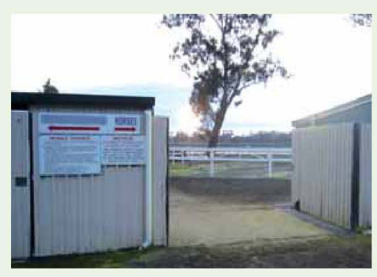
View from outside the main entrance looking towards the 'gap'.