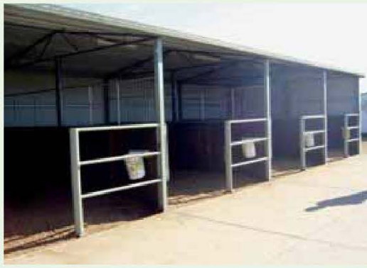
Stable areas are clean, hygienic, well lit and designed to provide a safe working environment for employees and contractors.