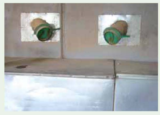
Feed is drawn on from the hopper bins as required eliminating the need to manually handle large, bulky and awkward bags.