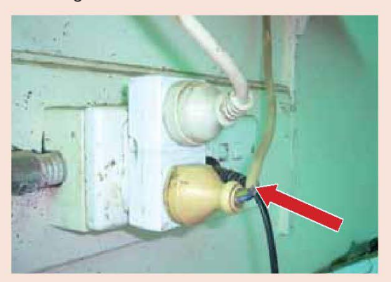
Damaged power leads which have not been inspected and tagged are used.