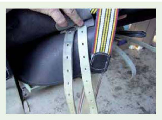
Saddle and stirrup leathers in good condition with no tears or splits in the stirrup strap eyelets.

- Riding a horse in a trial or gallop without race boots (with a heel) and safety irons.