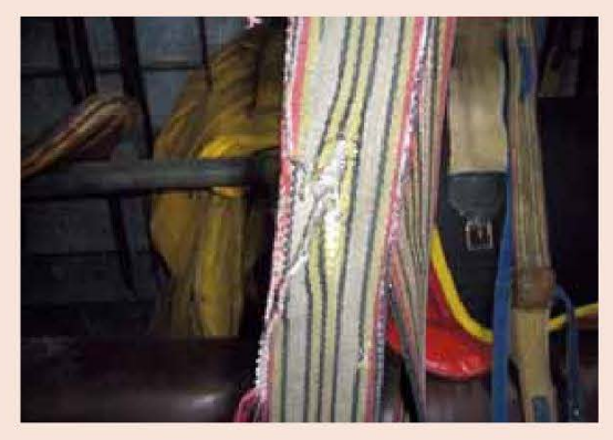
Girth straps - damaged and worn.

- Riding a horse in a trial or gallop without race boots (with a heel) and safety irons.