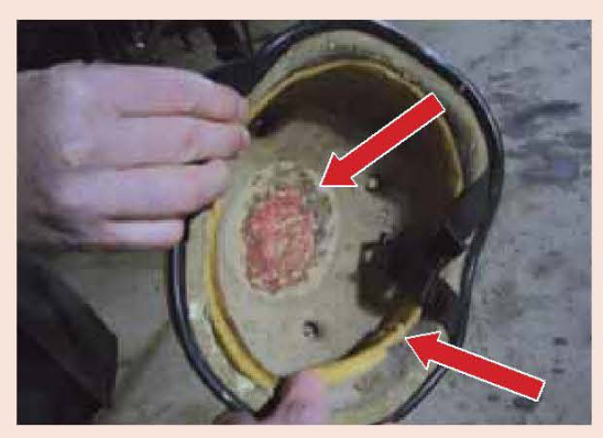
Riding helmet - damaged and well over five years old.