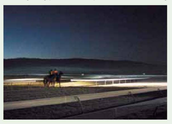
Sufficient lighting used at the 'gap'.