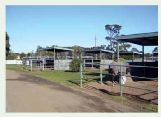
Stable yards are well laid out, tidy and maintained regularly to avoid risk of injuries due to slips, trips and falls.