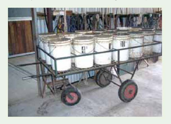
This feed trolley has wheels which allow the trolley to be used over rough terrain in and around the stable.