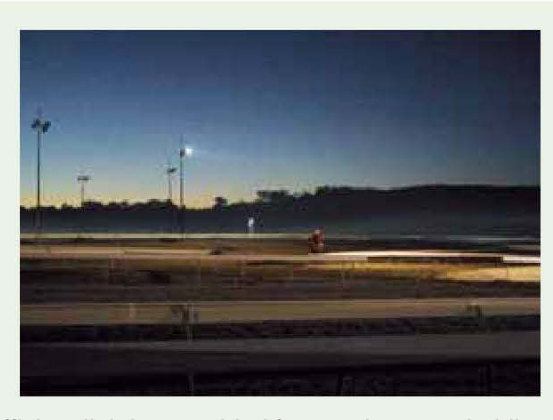
Sufficient lighting provided for pre-dawn track riding.