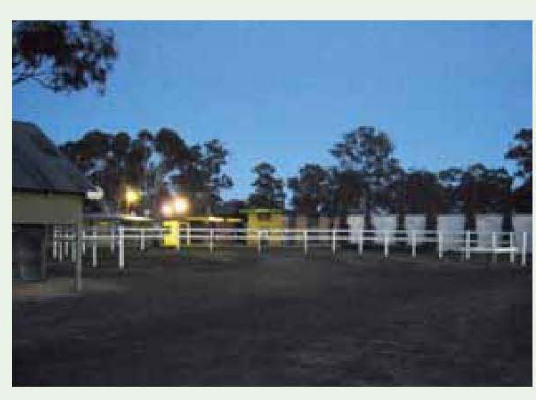
'Horse shoe' designed barrier looking towards the main entrance from the 'gap'.