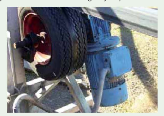
Horse walker drive motors, shafts or belts must be guarded.