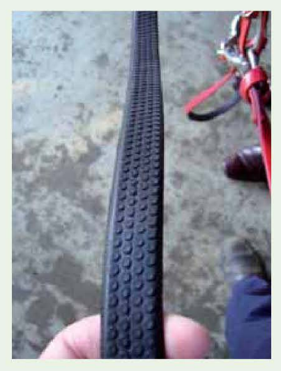
Riding reins have sufficient rubber tread to ensure satisfactory grip.

- Every saddle used in trials, tests or track work must be equipped with safety irons and race boots (with a heel) must be worn. In trials, provided the rider wears race boots, the saddle can be equipped with race irons.