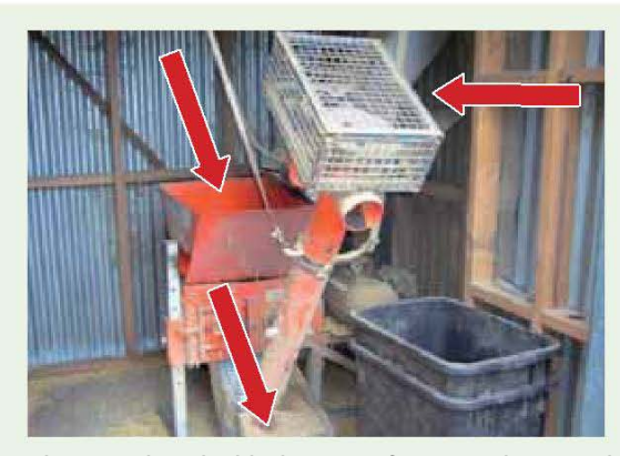
Hazards associated with the use of oat crushers and augers must be controlled.

Oat crushers, augers, mixers and horse walkers (continued)