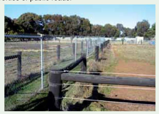
Stable perimeter and internal fencing suitable for containing horses.