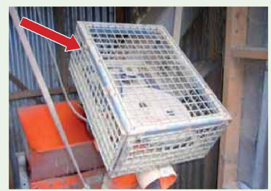
Exposed drive belts and pulleys must be guarded. As regular access is not required to this part of the machine, fixed guards should be used. Guards must be designed so that access by any body part can not be made with the hazard.