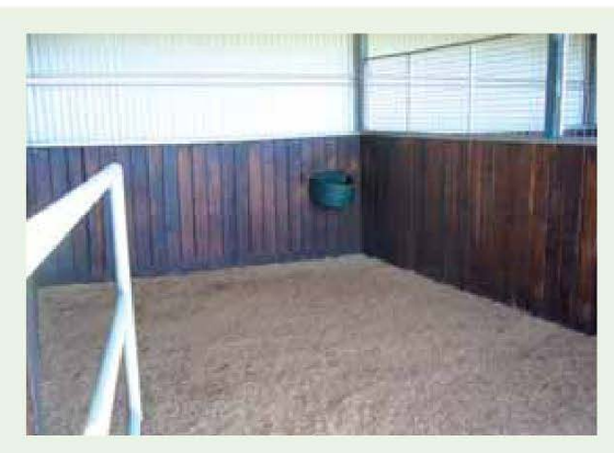
Stable boxes are hygienic, regularly cleaned and any damage promptly repaired.