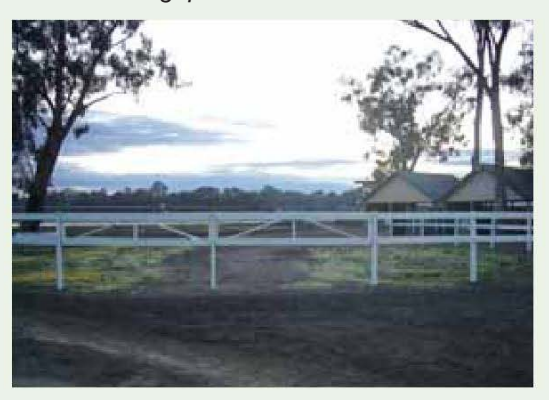
View from inside the main entrance towards the 'gap'.