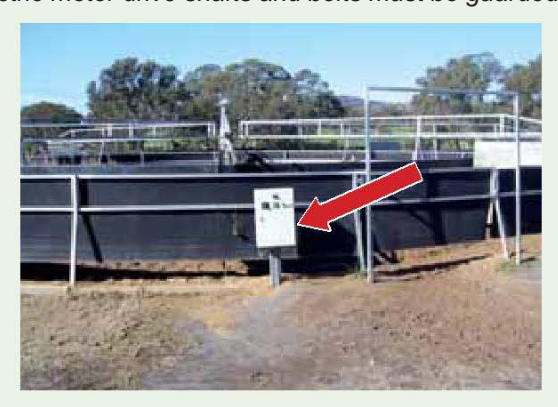
Horse walker controls are located in close proximity to gate and fitted with an emergency stop button.