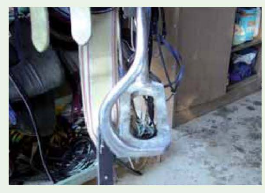
Safety irons used for track work.

- Every saddle used in trials, tests or track work must be equipped with safety irons and race boots (with a heel) must be worn. In trials, provided the rider wears race boots, the saddle can be equipped with race irons.