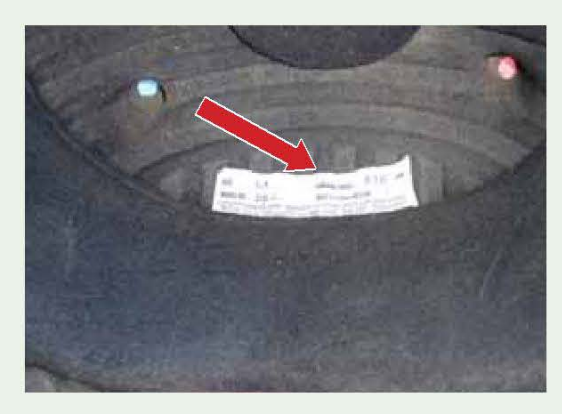
Helmets must be in good condition and not older then five years. The helmet manufacture date can be viewed on the Standards label inside the helmet.