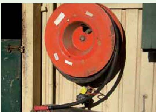
Fire fighting equipment must be adequately provided for in the stable environment and easily accessible at all times.