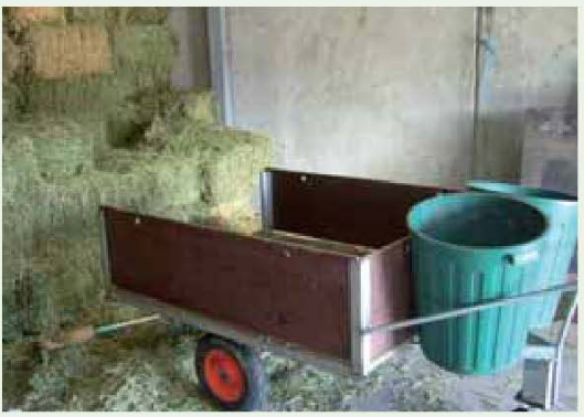
Purpose built trolleys for use around the stable significantly reduces the need to physically manage heavy, bulky or awkward loads.