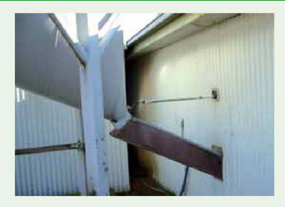
Silo is connected directly to the feed preparation area.