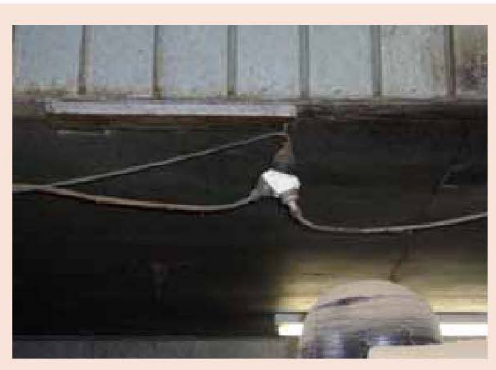
Portable power leads permanently used instead of fixed wiring.