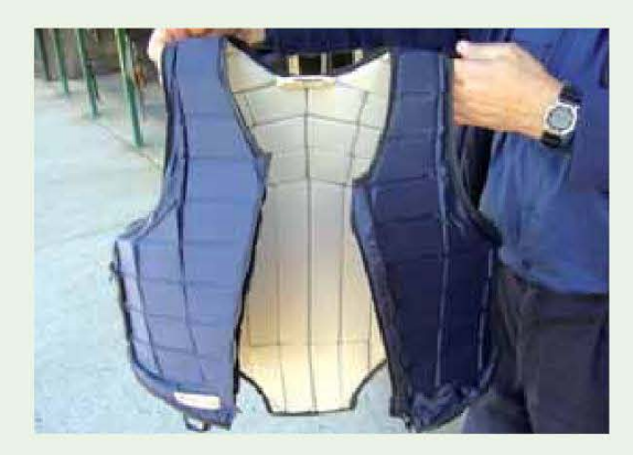
Body protector - no damage or excessive wear.